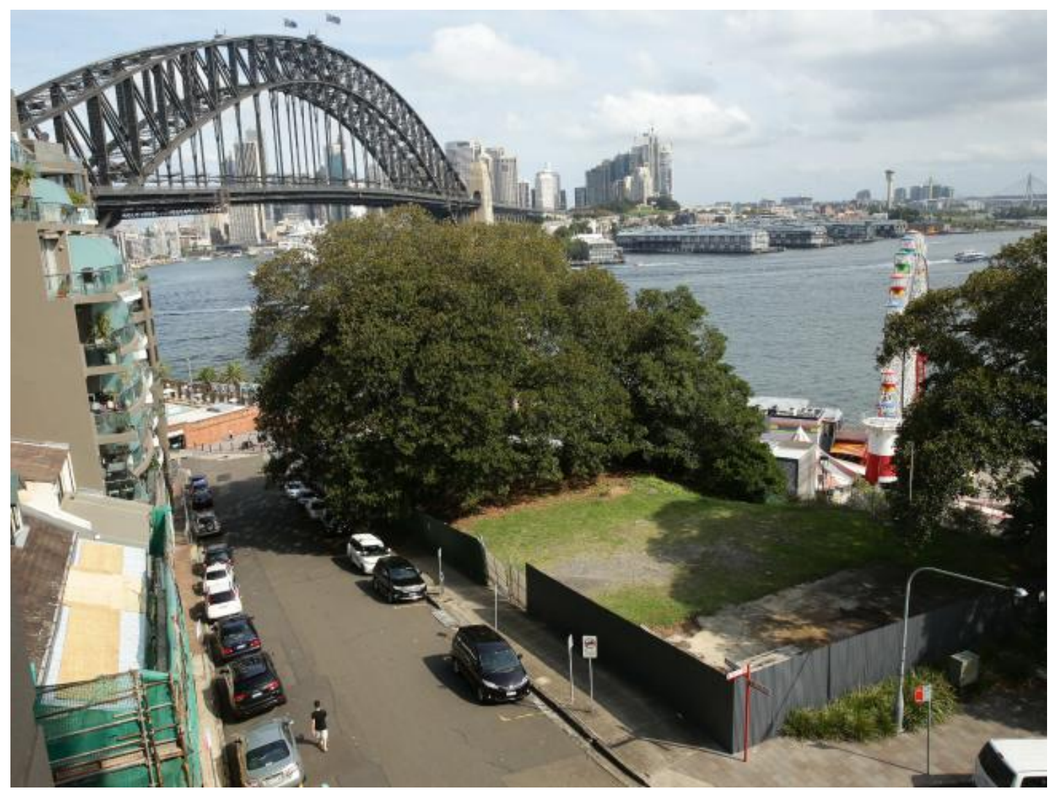
🖸 An aerial view of the clifftop site.

NSW Government pays $3.2m to Luna Park Sydney for Milsons Poin...ans in victory for Harry Seidler Park campaigners | News Local