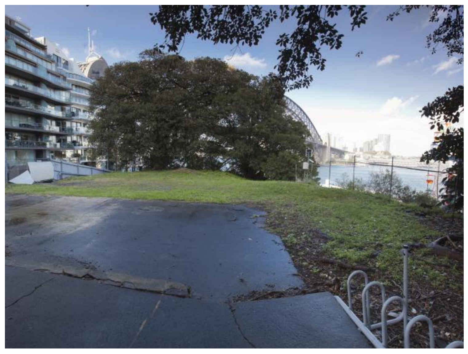
D The reacquired clifftop site adjacent to Harry's Park in Milsons Point.

"It's a wonderful outcome for the people of Sydney. I congratulate the government on not caving in to commercial pressure."